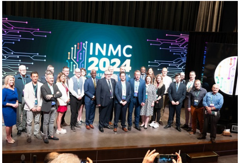
Opening ceremony at Anderson University