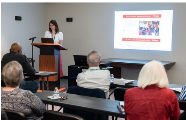
Launch of the partnership "Artist Residencies"