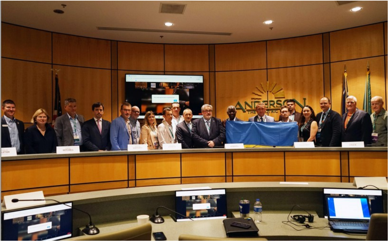
INMC General Assembly leaders around the Ukrainian flag