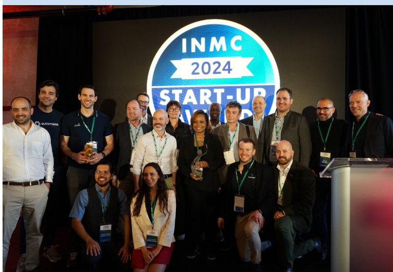
StartUp and International Jury of the 1st INMC StartUp Award

Discussions and presentations by cities focused on renewable energies and energy efficiency (ODD 7), the fight against climate change (ODD 13), and partnerships to achieve these goals (ODD 17), and responded to the commitments of the Querétaro Declaration signed in 2022 at the 3rd INMC Conference.