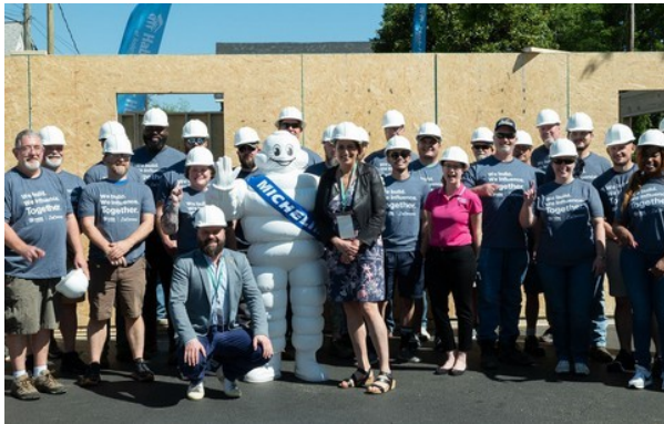
Creation of a social home for isolated women in Anderson

Clermont-Ferrand's presentation of the Gisèle Halimi social center prompted participants to rethink the decision by a city council to open a free, multi-service center.