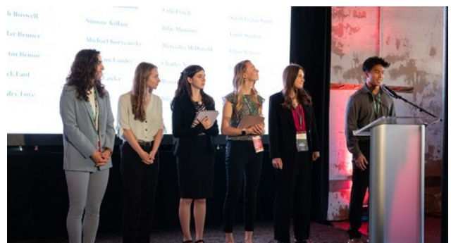
Student presentations on the themes discussed at the 4th Conference

One of the novelties of the 4th Conference was the creation of a student program, proposed by the Mayor of Querétaro during the 3rd Conference INMC. This program was relaunched in Anderson with the participation of 8 students from 8 INMC cities and students from Anderson, who were able to share their vision of the themes addressed during the Conference. A collaborative laboratory between the universities is currently being considered, with the aim of maintaining and expanding this dynamic and promising working group.