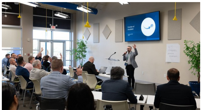
Presentation of the partnership "Corridor of Incubators"

Beyond the speeches, the following days were structured around various thematic workshops, "labs", each focused on crucial issues of urban development