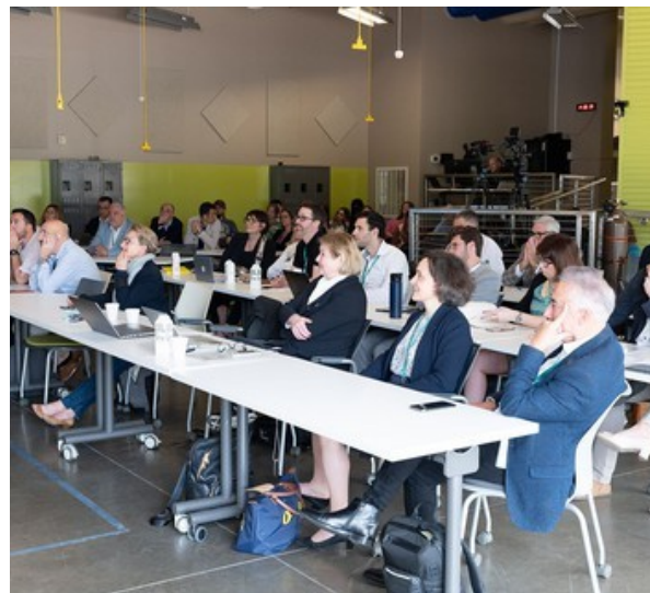
Mobility Lab for All: sharing expertise